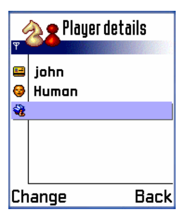
Choose change to add a phone number

b) Enter number manually: If you prefer to enter the phone number manually, select "No" when prompted to link to "Contacts", and then enter the desired phone number.