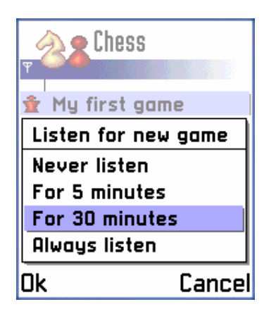
"Listen for" preferences