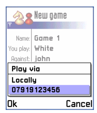
New Game over SMS

If you do not want to play Chess via SMS at all, you should select the Never listen option. All new game requests from other SMS opponents will then stay in the general SMS Inbox, and you can delete them at any time.