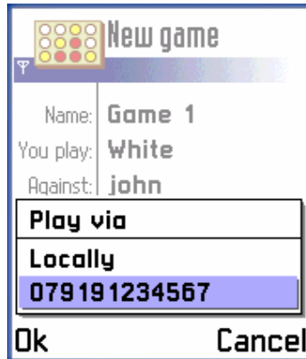
New Game over SMS

If you do not want to play Four-in-a-Line via SMS at all, you should select the Never listen option. All new game requests from other SMS opponents will then stay in the general SMS Inbox, and you can delete them at any time.