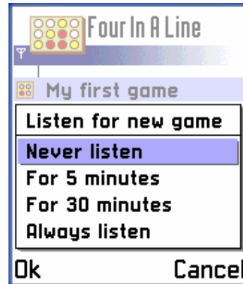
“Listen for” preferences