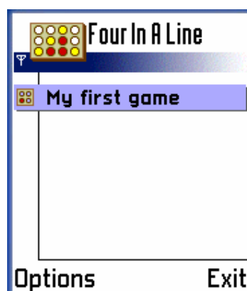
Game list view