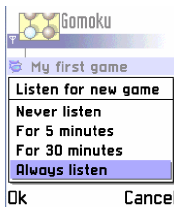
“Listen for” preferences