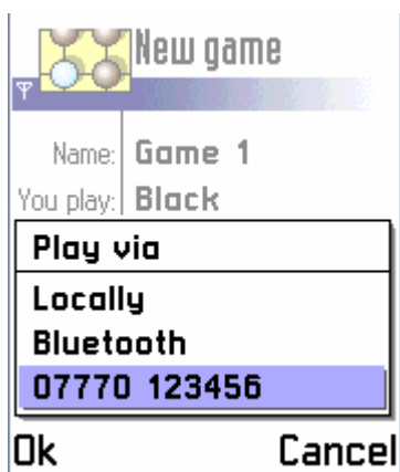
New Game over SMS