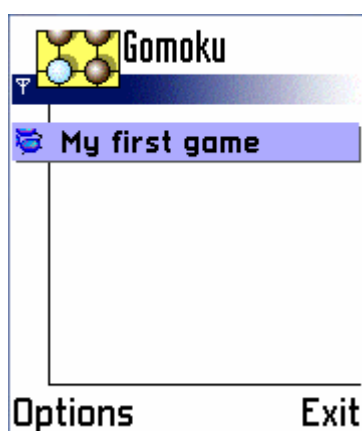
Game list view